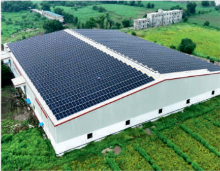
1000 KW Project