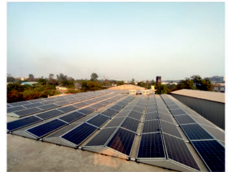
250 KW Project