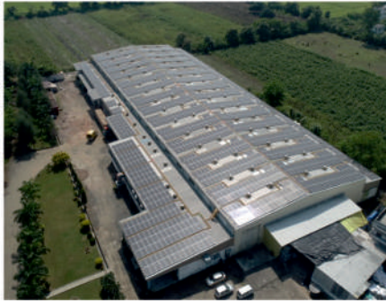
650 KW Project