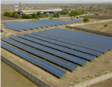
1000 KW Project