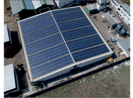
620 KW Project