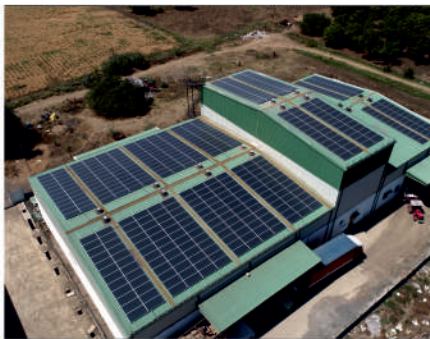
700 KW Project