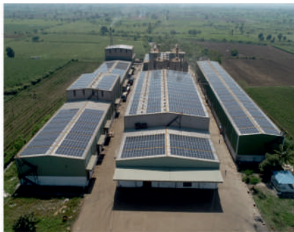
1250 KW Project