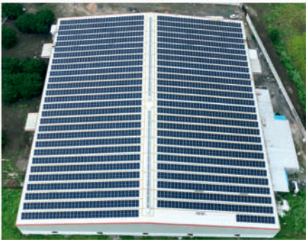
1000 KW Project