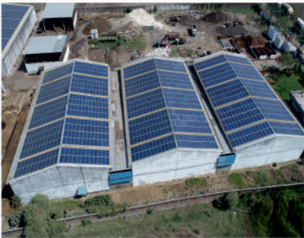
650 KW Project