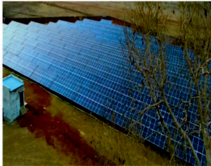
1000 KW Project