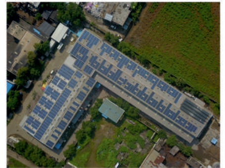
600 KW Project