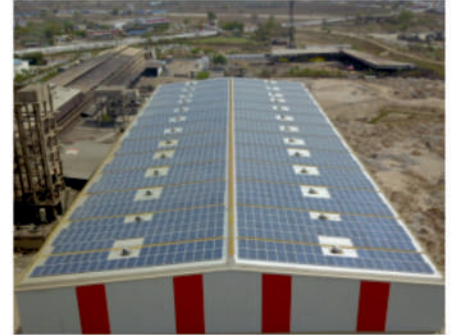
600 KW Project